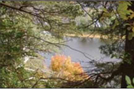
View from Arcola Bluffs