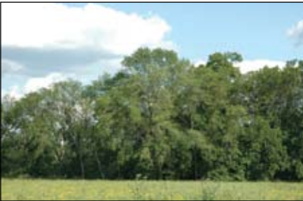
View of Lots – Tree line