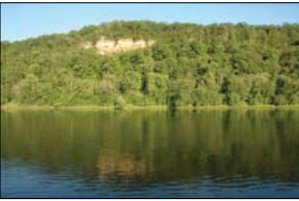
Arcola Bluffs from the St. Croix River

Arcola Bluffs on the St. Croix For more information on lot availability and pricing, visit: www.arcolabluffs.com Or contact Brian Axdahl 612-991-7492 17120 116th Street North Stillwater, MN 55082